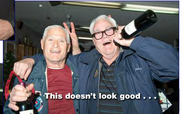
This doesn't look good . . .