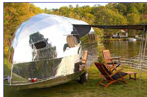
Upcoming Labor Day Weekend at Albion. See page 6.

Tom Gardner appears to be struggling to hold on to something. The way he's positioned, we're not sure if it's something really big or maybe his dive hood is just too tight. See page 4 to find out the answer. ★