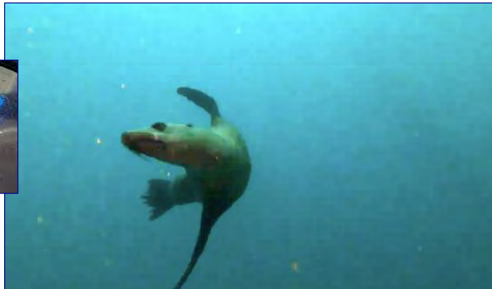
Screen shot from Ken's GoPro video on FaceBook of a friendly seal.

We got into dry clothes and went to Crossroads BBQ for a yummy delicious and highly nutritious warm lunch.