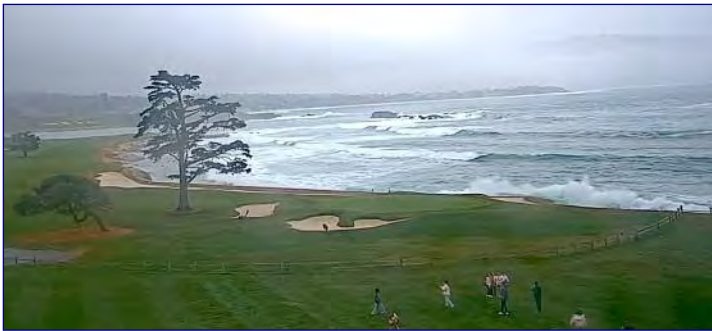
Image from the Pebble Beach Golf Course webcam on December 14th