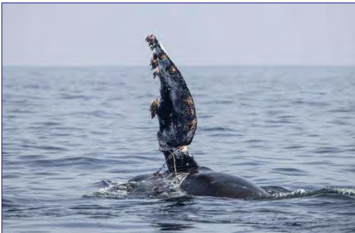
The humpback whale raises its entangled pectoral fin.

Video recorded by Davey’s Locker and Newport Landing Whale Watching, that was shared with KTLA TV, shows what appears to be a strong piece of fishing line wrapped around the pectoral fin and through the mouth of a humpback whale.