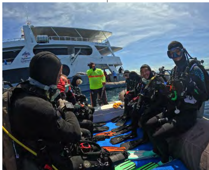
Departing the Mother Ship for a dive

Most of the 15 divers completed all of the 20 dives offered and thus earned the Aggressor Fleet’s “Iron Diver” award. We encountered some pretty strong currents, but nothing this group couldn’t handle! The dive masters gave great pre-dive briefings and were great at pointing out critters during the dives.