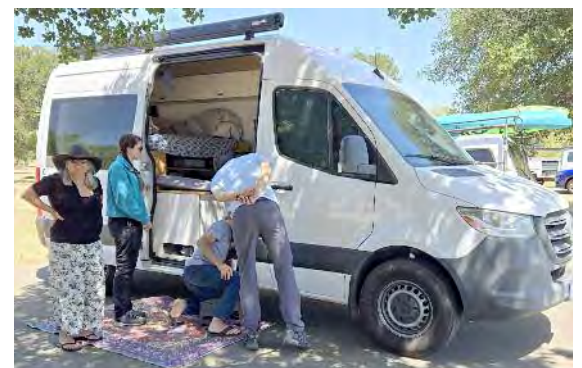
Dippers checking out Gabi's new ADU (Accessory Dwelling Unit) on wheels!