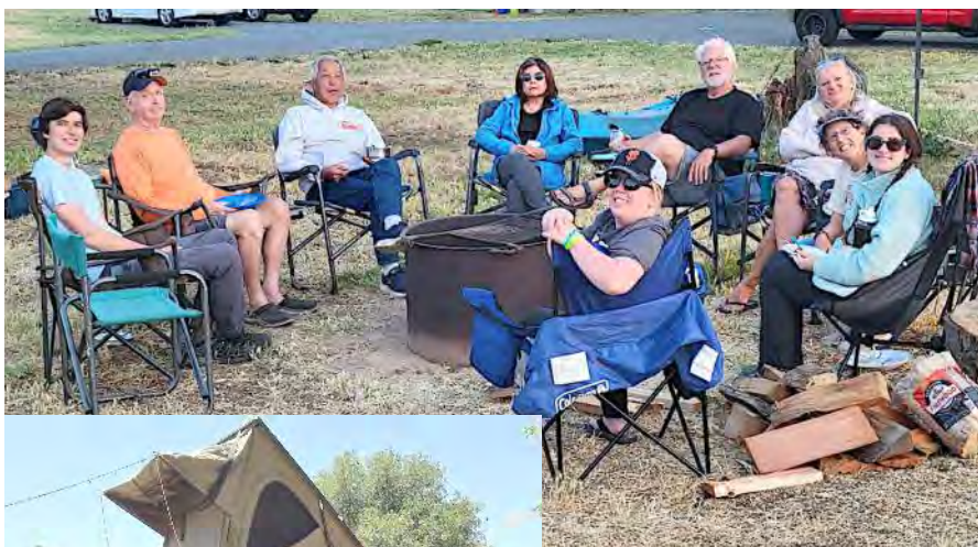
Great time sitting around the campfires telling lies, er stories.