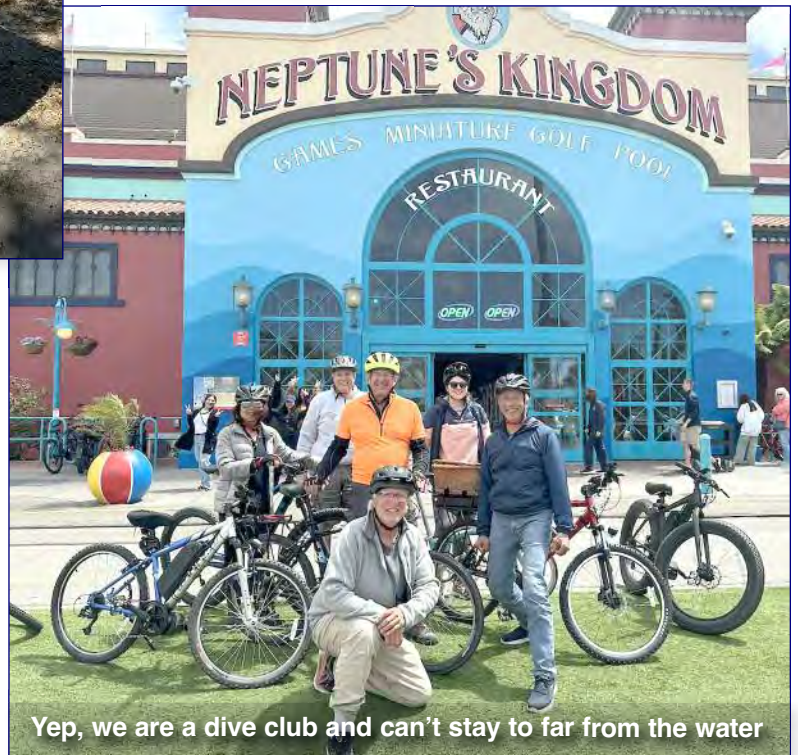
Yep, we are a dive club and can't stay to far from the water