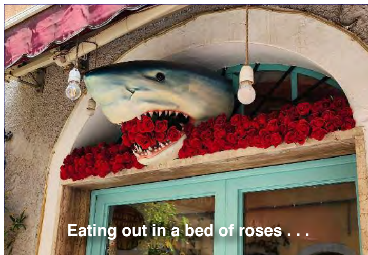
Eating out in a bed of roses . . .