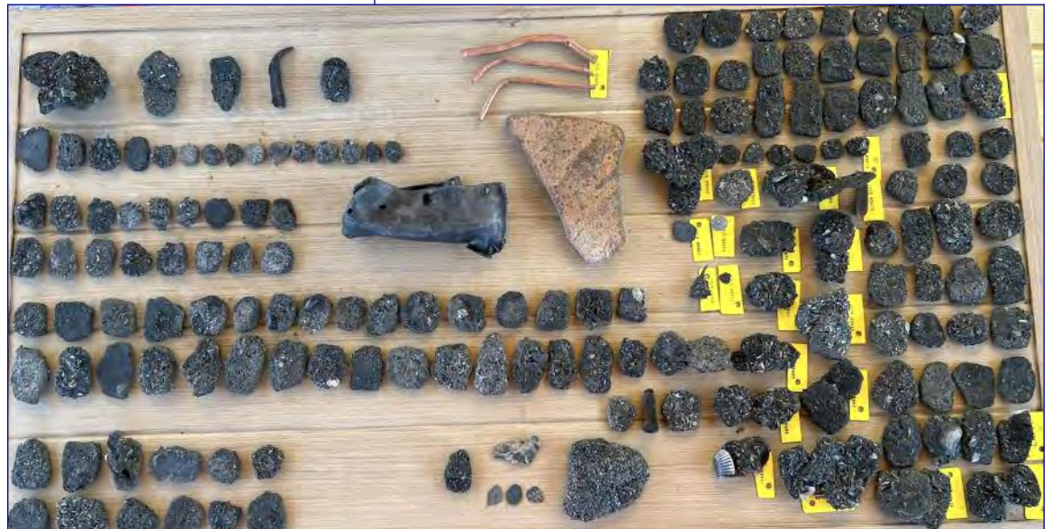
The divers said they recovered more than 200 silver coins and artifacts from the shipwrecks.

over the Americas. But the biggest threat came not from treasure-seeking rivals but from unexpected hurricanes. The wrecks of two of the ships sunk by powerful storms — the Urca de Lima from the 1715 fleet and the San Pedro from the 1733 fleet — are protected as Florida Underwater Archaeological Preserves.