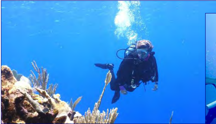
Clear warm waters beckoned our Dippers.